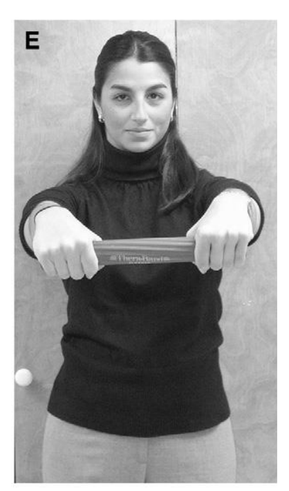
(D) Arms brought in front of body with elbows in extension while maintaining twist in rubber bar by holding with <u>noninvolved</u> wrist in full flexion and the <u>involved</u> wrist in full extension . (E) Rubber bar slowly untwisted by allowing <u>involved</u> wrist to move into flexion, ie, eccentric contraction of the involved wrist extensors.